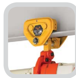
Push Trolley (for max. 480kg)