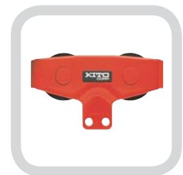
Mini Trolley TMH25 (for 60 - 240kg) Part No. 48350