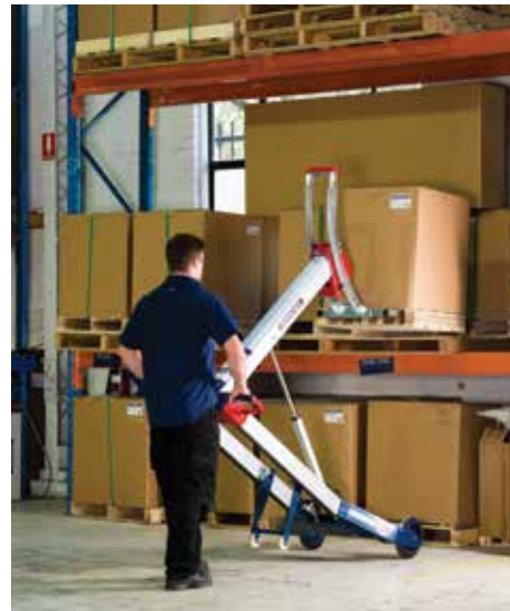
(left) Fork attachment comes with removable tilt head and fork lift arms, sold separately.