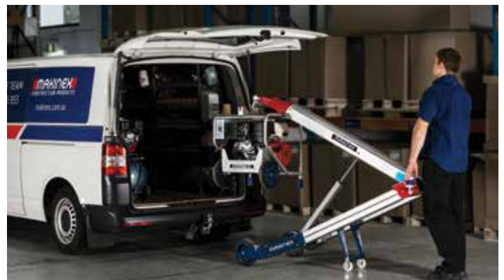
(below) Hook attachment comes standard and is used for lifting, moving and loading small equipment and machinery fitted with a lifting eye, e.g. water pumps, generators, air compressors, plate compactors.