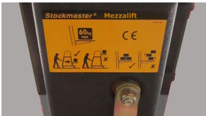
A reliable manually operated winch transfers loads up to 60Kg.