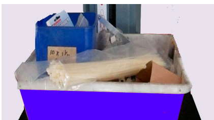
For safe transfer of small items always use a picking bin.