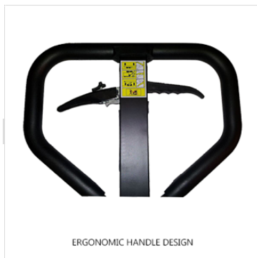
ERGONOMIC HANDLE DESIGN