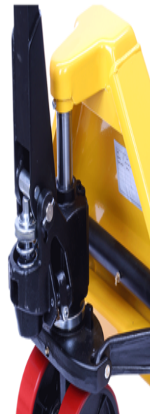
PRECISION HYDRAULIC PUMP