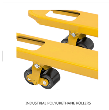
INDUSTRIAL POLYURETHANE ROLLERS