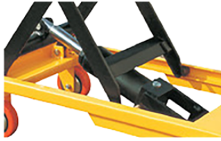
PRECISION HYDRAULIC PUMP