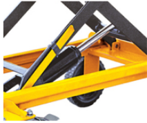
PRECISION HYDRAULIC PUMP