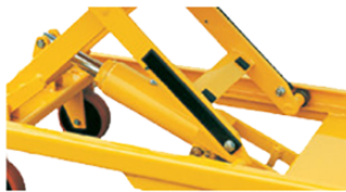
PRECISION HYDRAULIC PUMP