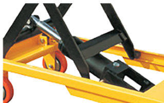
PRECISION HYDRAULIC PUMP